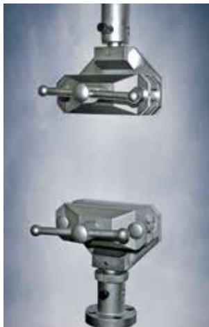
Side Action Grips