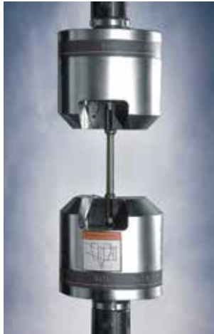
Hydraulic Wedge Grips